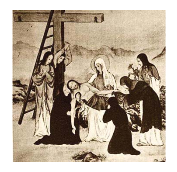
(14) Jesus is taken down from the Cross and placed in the tomb