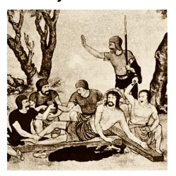
(10)Jesus is crucified