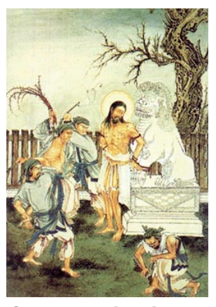
(6) Jesus is scourged and crowned with thorns