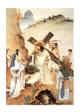
(7) The Cross is placed upon Jesus' shoulders