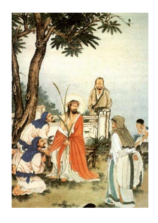
(4) Jesus is denied by Peter