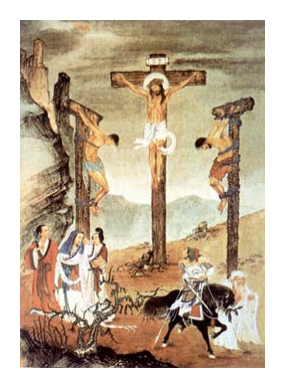
(13) Jesus dies on the cross