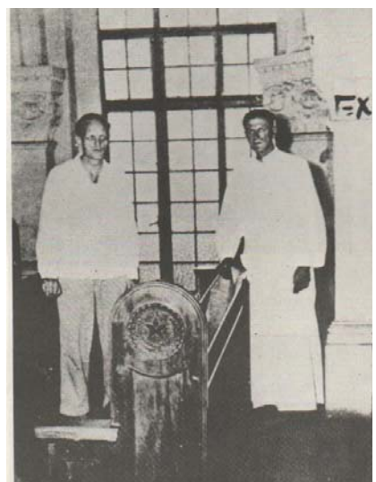
The two survivors

After they had completed their gruesome work, the soldiers left the chapel which was now littered with dead and dying bodies and pools of thick blood. Some, however, would survive their wounds and live to tell the tale. One such was