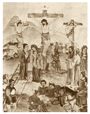
(11) Jesus promises his Kingdom to the Good Thief