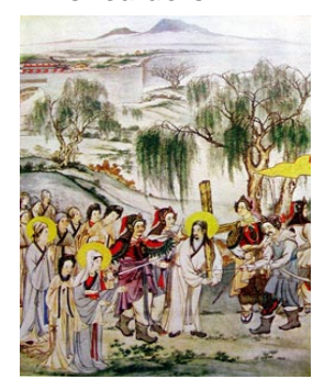
(9) Jesus meets the women of Jerusalem