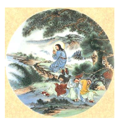
(2) Jesus is betrayed by Judas and abandoned by his disciples