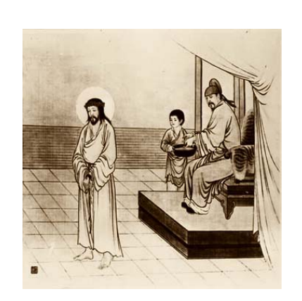
(5) Jesus is judged by Pilate