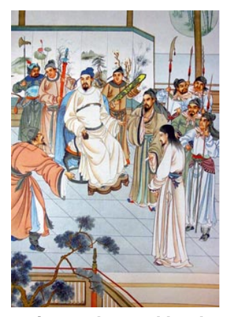
(3) Jesus is condemned by the Sanhedrin