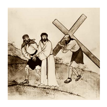
(8) Jesus is helped by Simon of Cyrene to carry the Cross