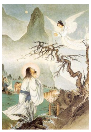
(1) Jesus in agony in the Garden of Olives