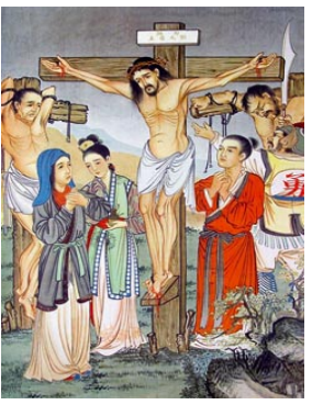
(12) The Mother of Jesus and the beloved disciple at the foot of the Cross