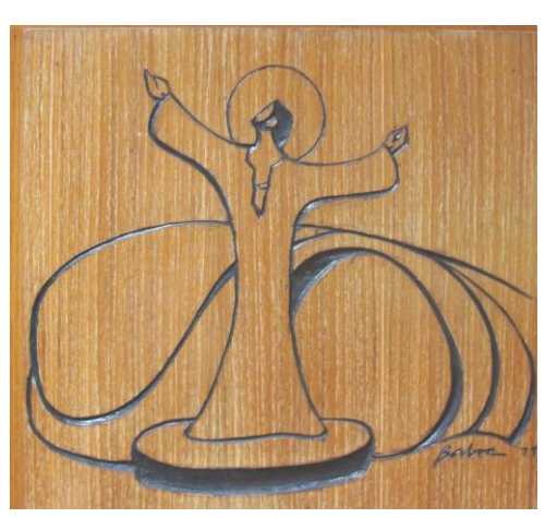
The Lord is truly risen Alleluia