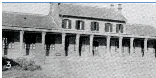
Brothers' residence in Moukden

Letters from Rome reach us, as did your latest, via Siberia. It is not the same with America. Canadian shipping in the Pacific is quite irregular.