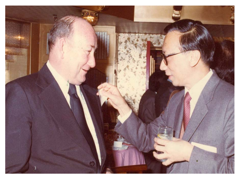
Not so stern at times!

He could appear somewhat stern and spoke only when necessary. His classroom was always the most silent. Pupils tended to keep a respectful distance. Yet, here is a nice piece from one of his students at the time: