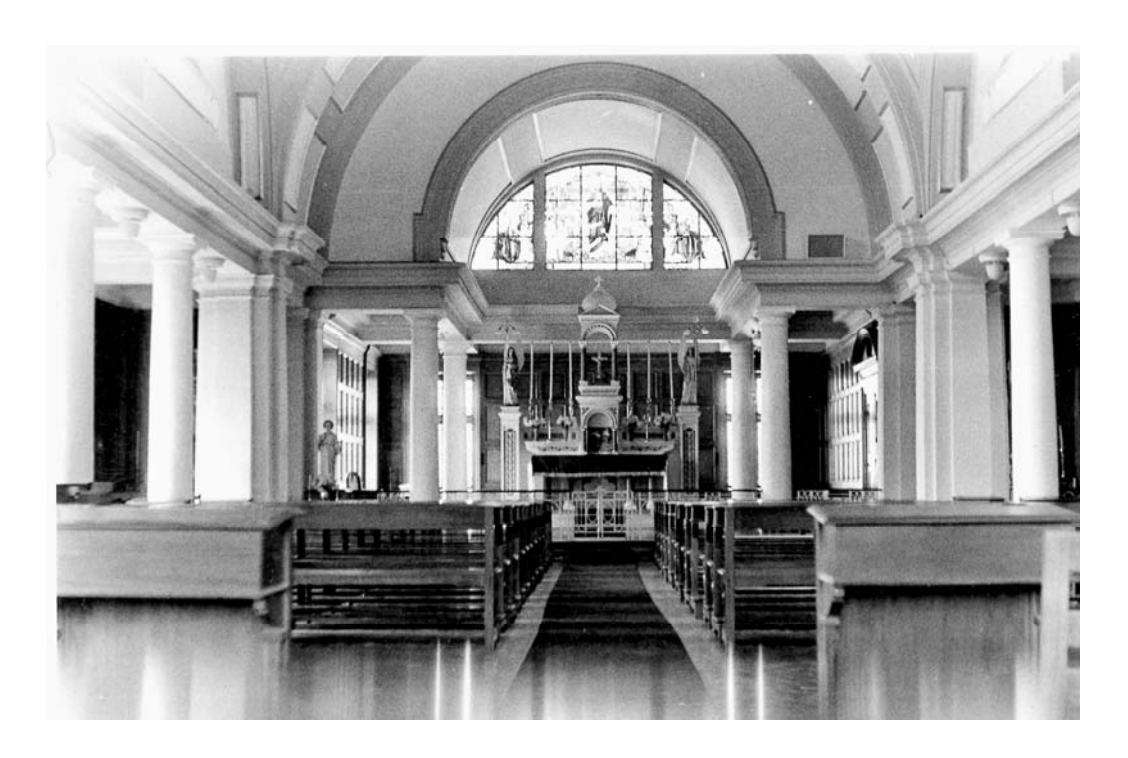
The beautiful chapel that was under the 'Dome' in La Salle College