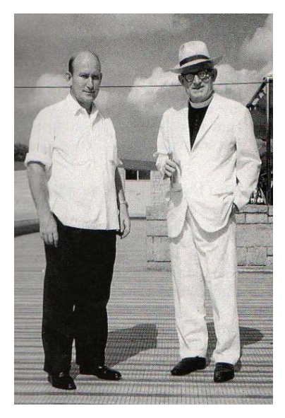
The founding fathers of Chan Sui Ki (La Salle) College

He proved to be a fine Principal, with clear objectives and targets. He treated his teachers and office staff as responsible adults but always kept the welfare of the pupils as his primary focus. His inherent sense of fair play, his firmness when required, his insistence on good order and discipline, inspired confidence and co-operation. He saw no reason why the school should not excel and excel it did.