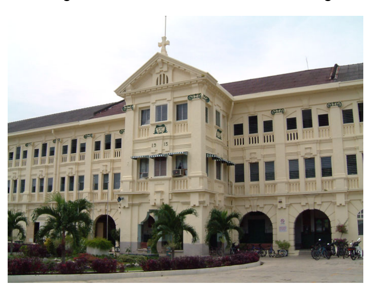
St George's Institution, Taiping

In 1948 he received the sad news that his father, aged 63, had passed away in Hong Kong. In those days it was not customary for the Brothers to go home. He was allowed home the following year after making his final profession. He had left home at the age of fourteen and was now returning at the age of twenty five. After his home